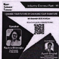
IC_PART 10.jpg 139K